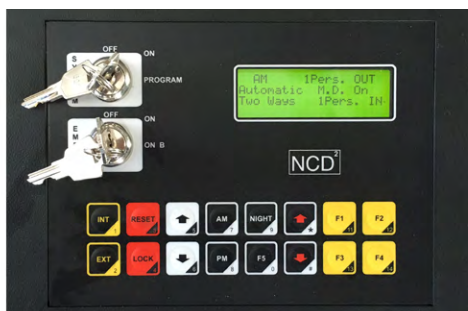
COMMAND & SETTING CONSOLE