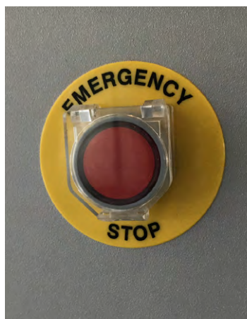
INTERNAL EMERGENCY PUSHBUTTON