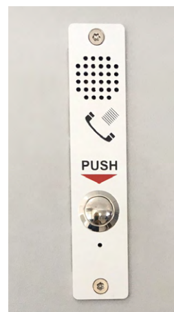
EXTERNAL SIDE PUSHBUTTON, TRAFFIC LIGHTS & INTERCOM